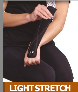
APPLY: With palm down and wrist flexed forward, apply a light stretch along your forearm, finishing before the elbow joint.