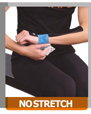
FINISH: With two inches remaining, lay the end down with no stretch.

Avoid overlap of the half strip ends to prevent compression.