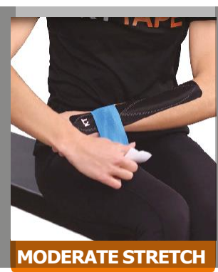
APPLY: Apply the middle of the half strip with moderate stretch across the back of you wrist ending on the other side of your wrist.

Avoid overlap of the half strip ends to prevent compression.