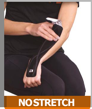
FINISH: With two inches remaining, lay the end down with no stretch.